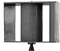
WRE.030.MSP.E Potency curve (nominal-on axis)